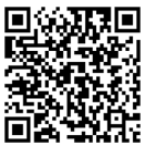
S410 3D demo