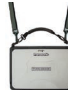
(tablet sold separately)