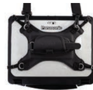
(tablet sold separately)