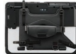
(tablet sold separately)