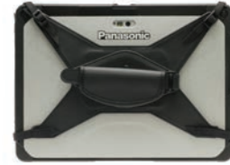
(tablet sold separately)